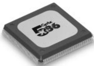
The Cyrix 5x86 QFP processor

® All systems tested with identical hard drive & graphics card.