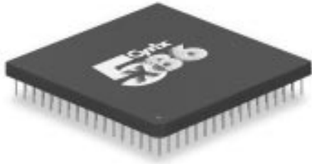
The Cyrix 5x86 PGA processor