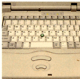
The MousePoint - Toshiba's solution to your mouse problems - is built into the full-function 84-key keyboard