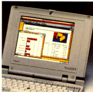
Capture all the colours of the rainbow, and then some, on the T3400 CT's 7.8" screen