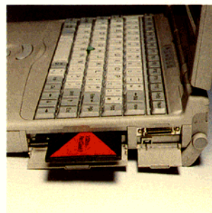
Toshiba's built-in PCMCIA 2.0 slots make expansion options as easy as A-B-C