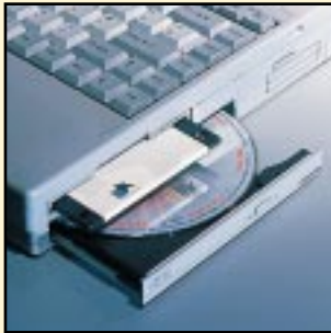
A win/win situation: the double bonus of integrated diskette and CD-ROM drives.