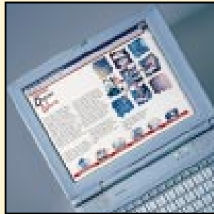
Great looks: with a 12.1" DSTN (CDS) or TFT (CDT) screen you'll always be in the picture.