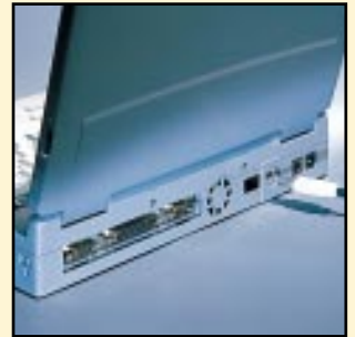
Good connections: all the vital in- and outputs are at the back of the notebook. There's even a USB port.